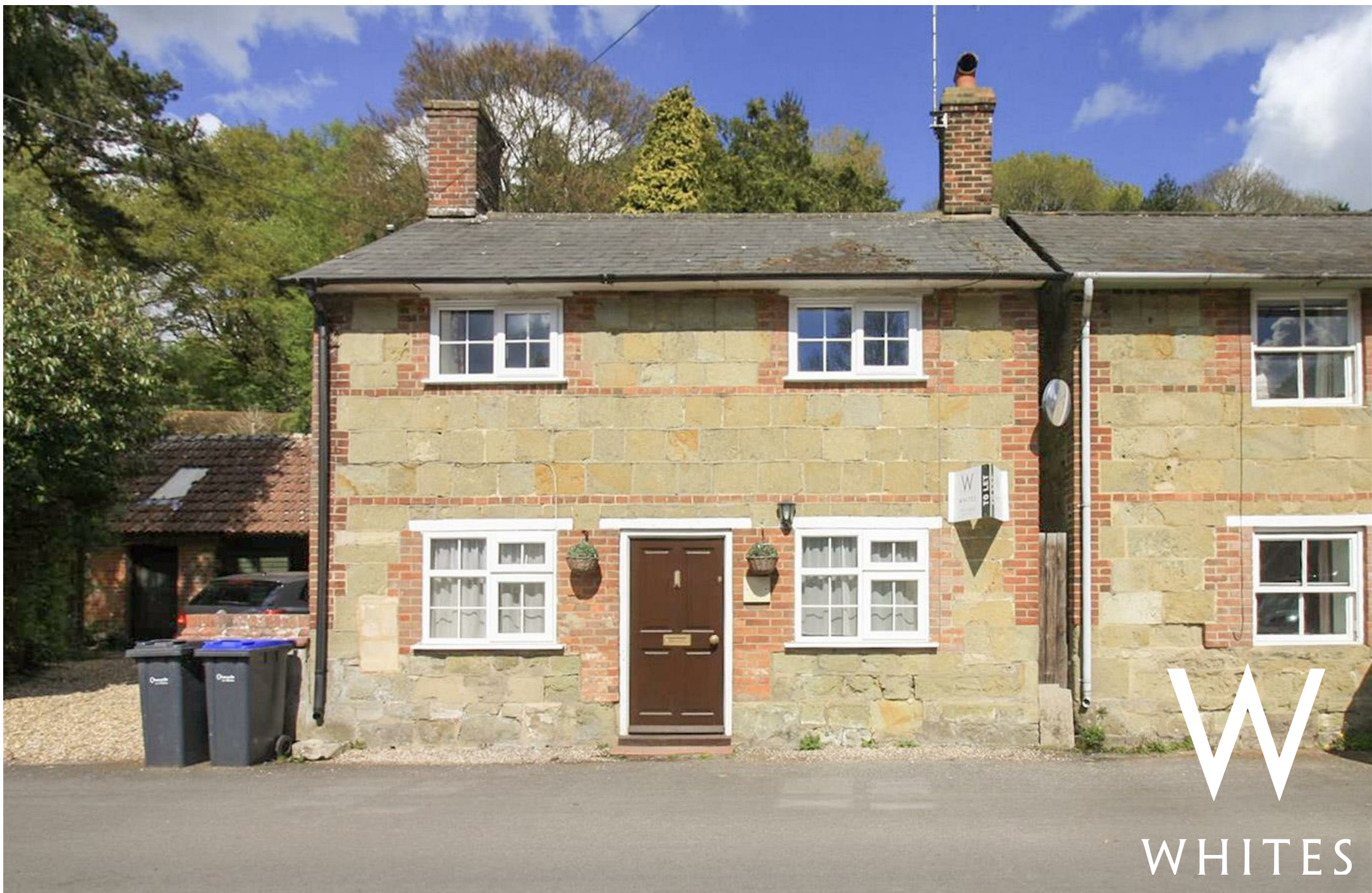
The Old Post Office High Street, Fovant, Salisbury, Wiltshire, SP3 5JL